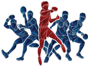
TABLE TENNIS PASS

During last term we ran our annual Easter challenge.