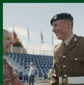
AFC HARROGATE FILM

Watch this short film to learn more about the Army Foundation College in Harrogate