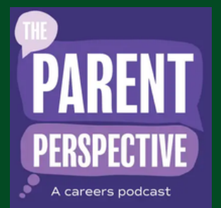
THE PARENT PERSPECTIVE PODCAST

Listen to The Parent Perspective podcast episode dedicated to the Army