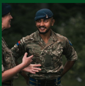
ARMY RECRUITMENT CENTRE

Explore the websites and resources below: