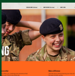
ARMY JOBS WEBSITE

Visit the Army Jobs website to explore different roles and to ask your questions