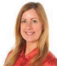
Head of Modern Foreign Languages

Have a lovely summer! À bientôt! ;Hasta pronto!