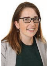
Head of Science